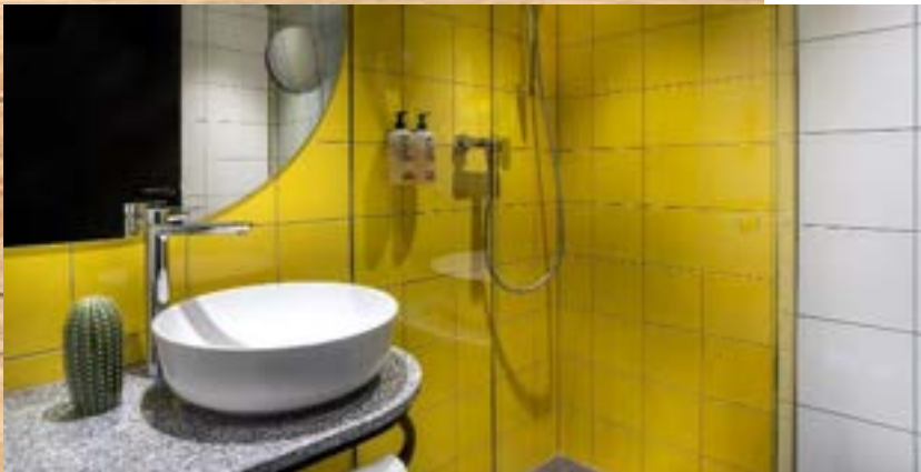
Modern bathrooms in our Superior rooms