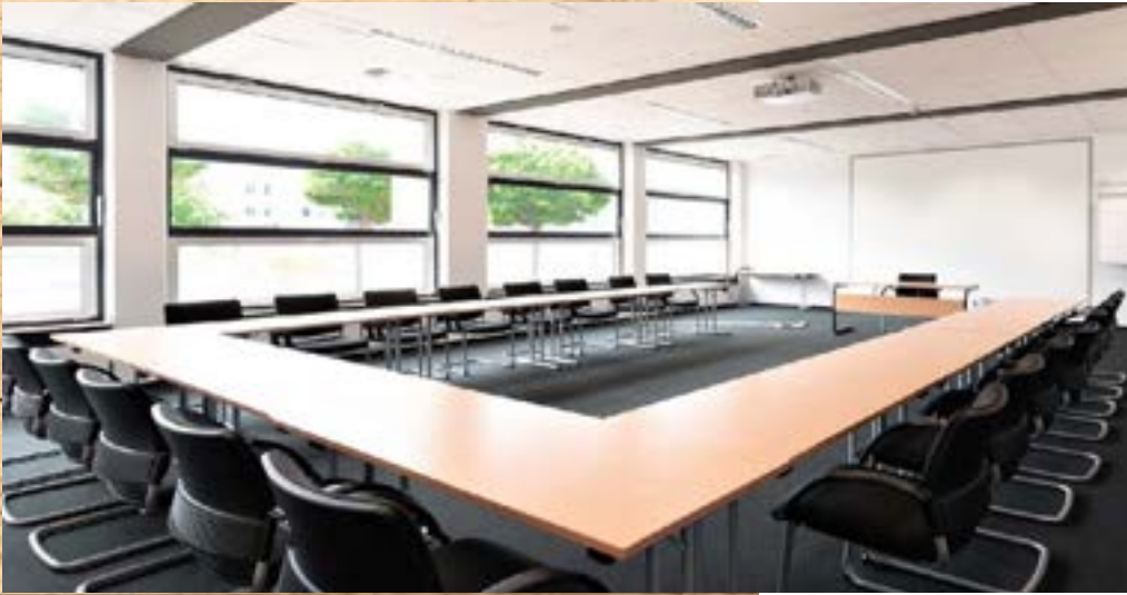
Rooms perfect for board meetings in the popular U-Shape