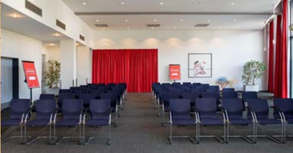
Our largest room BERLIN – 174 m 2 and projection wall