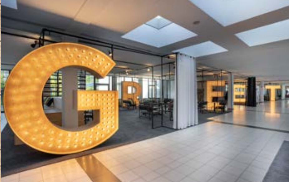
Bright work and project rooms from 12 to 174 square meters

Virtual Tour scan here to have a look around